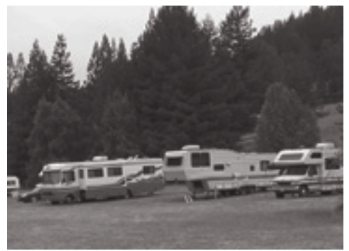
RV's and Tent Campers Welcome

Accommodations: You could make a vacation around this event. Self-contained RVs and tent campers are welcome to set up from 6/20 - 6/24. Campfires only in designated areas. There are no 120v hookups. There is a chemical blue room in the meadow. Restrooms at the degree site have hot water and a shower in the men's is available to women. Motels are available at the coast, 30 minutes on a dark and winding road from the RAM site. Call as soon as possible for your reservations, it's a popular tourist area.