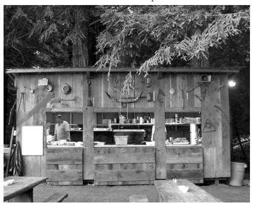
Comptche Cook Shack